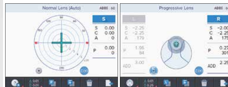
Auto Lens Recognition

With the newly designed nose cone and lens support of the HLM-1, you can easily measure today's small-sized frame styles with ease.