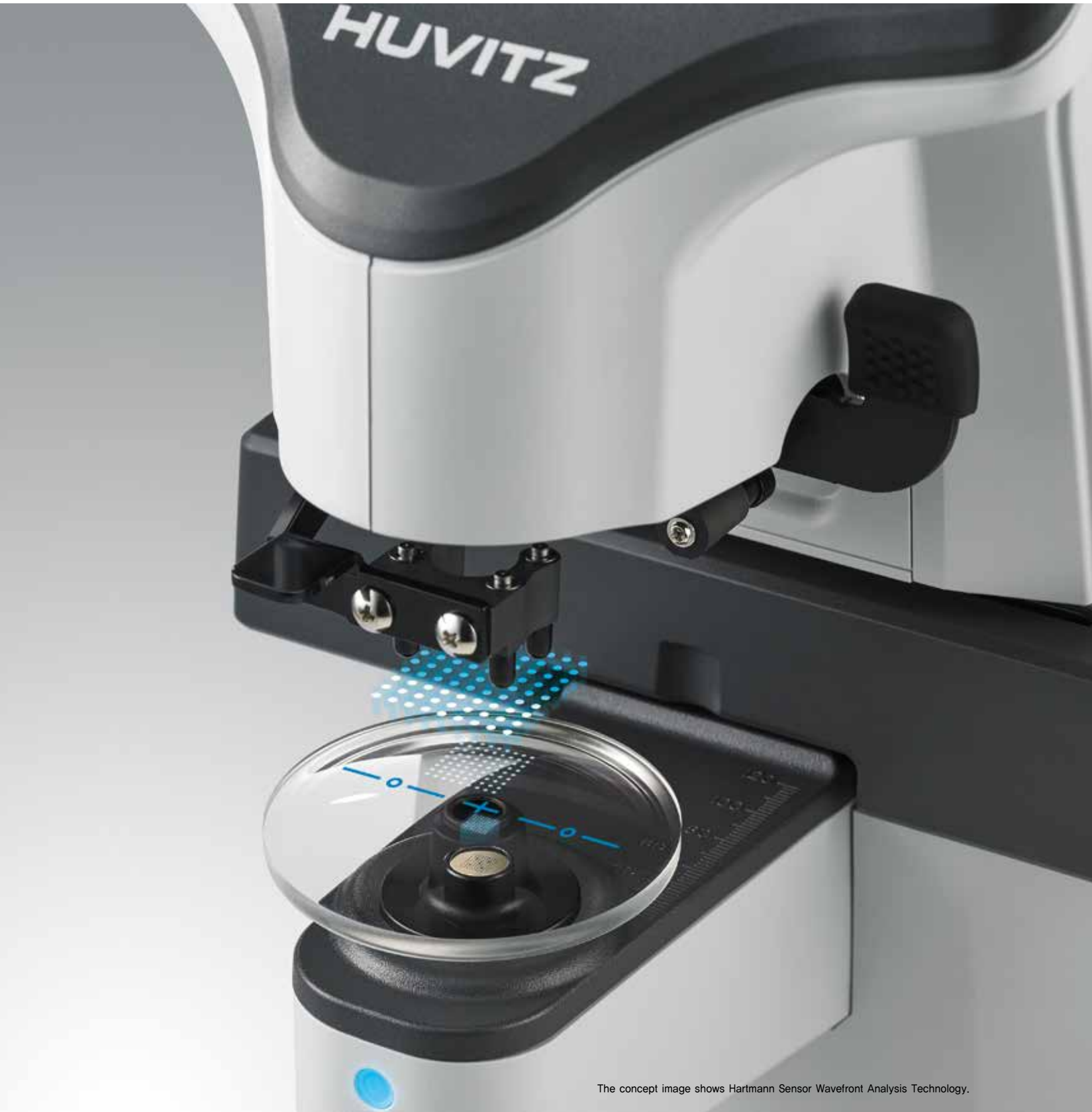
The concept image shows Hartmann Sensor Wavefront Analysis Technology.