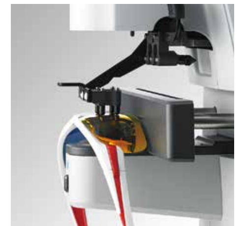
Mirror Lens Measurement